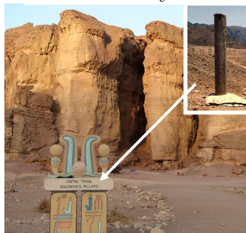
Picture 28: Current sign identifying the location of Solomon's Column to identify the place of Israel's Red Sea crossing. The pass in the background shows the place where the Israelites entered the beachfront. Pharaoh's men entered the same way. The column was on its side near the edge of the water when it was found in 1978. By 1990 it had been stood up and placed in concrete. When it was found the engraving was worn off by the rising waters and blowing sand.