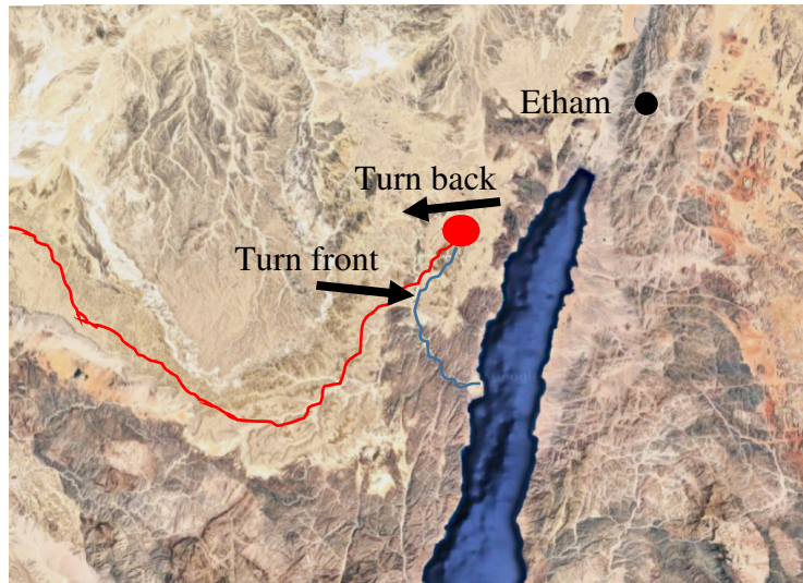
Map 19: Israelites turn back (west) and then turned front (east) to enter a pass through the mountains that led them to a beach where they are surrounded by mountain walls and water.

Nevertheless, without the knowledge of the exact locations, the Scripture still says, “ turn back before ” and “ camp in front ... opposite it, by the sea. ” It seems that the LORD led the Israelites backward (to the west) and then to the front (to the east) to the beach by the sea. In other words, the children of Israel were to retreat to the west through the valley they had just trod to a place where they would then turn to the east and enter a campsite on the opposite side of Baal-zephon (location unknown). That site would be on the opposite side of the mountains of the wilderness of the Red Sea that had been on their right for most of their journey. This move would cause Pharaoh to think they were lost and wandering without direction. In reality, the LORD would direct them down a 20-mile canyon with high mountains on each side that would lead them to a campsite on the west bank of the east finger of the Red Sea.