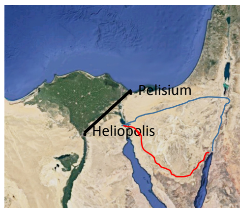
Map 16: Wall of Shur and the two trade routes out of Succoth to the fresh water at the head of the Aqaba.