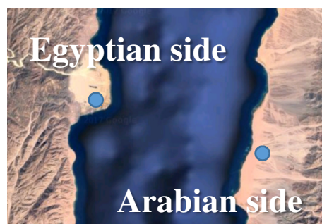
Picture 27: Location of two columns set by King Solomon to mark the location of the Red Sea crossing

Exodus 14:13 But Moses said to the people, "Do not fear! Stand by and see the salvation of the LORD which He will accomplish for you today; for the Egyptians whom you