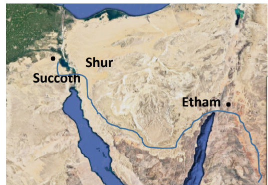
Map 18: Route of Israelites to Sinai had Pharaoh not chased after them.

On map 17, the line indicates the probable direction of the Israelites when they left Succoth. The line shows the easiest route between the mountainous ranges of the wilderness of Shur/Etham and the wilderness of the Red Sea. Any other route would require climbing and descending the mountains, adding 100 or more miles to the trip. Had Pharaoh not chased the Israelites, the people would have crossed the mountain range near the Mount of Etham and moved south to settle at the foot of Mount Sinai as seen on Map 18. But evidently, Pharaoh and his men nearly caught up with the Israelites about where the dot is at the end of the line on map 17.