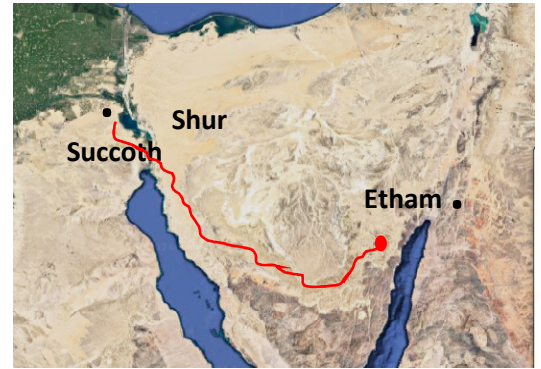
Map 17: Location of Mount Etham Also known as Ithm, Itm, Yitm, Lithm, and Ithem

can think of him as a true Indiana Jones type who spoke more than 20 languages and explored Asia, Africa and the Americas as well as the land of Midian searching for ancient treasures of gold. Fortunate byproducts of his detailed diaries were his hand-drawn maps. The details in his maps were based on the places he visited and the historical background that he learned from the local people. On his maps he placed Etham as the highest peak of the mountain range at the north end of the Gulf of Aqaba. Several spellings exist for this mountain peak and the range where it is found including Ithm , Itm , Yitm , Lithm , and Ithem , depending on the dialect in use as noted by T. E. Lawrence in his book The Seven Pillars of Wisdom (1926). Even modern maps still use the name Ithm for the mountain peak.