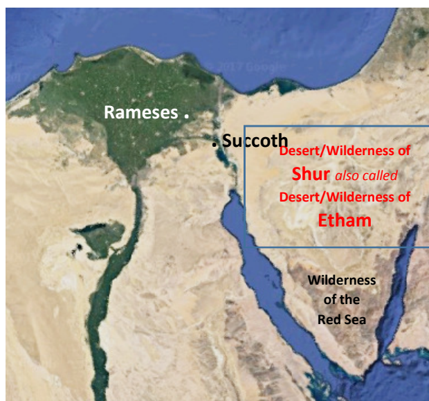
Map 15: Desert/ Wilderness of Shur/Etham

If the book of Exodus calls the region the desert of Shur and the book of Numbers calls it the desert of Etham, is it possible that the two are the same? Stepping away from religious resources and into the world of archeology, we find that the British explorer Sir Richard Frances Burton chronicled his expeditions in his book The Gold of Midian . Burton lived from 1821 – 1890. We