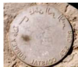
Picture 30: In 1978, a matching column was also found standing on the Arabian side of the Red Sea. The engraving indicated that King Solomon placed the column there to identify the Red Sea crossing of the Israelites to the Arabian side of the gulf. By 1990, the column was replaced by this marker.